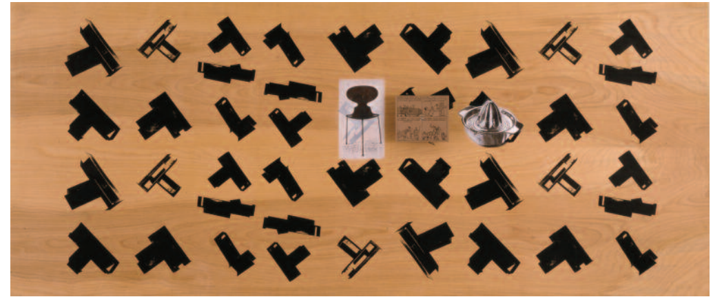
MD 4, 1990