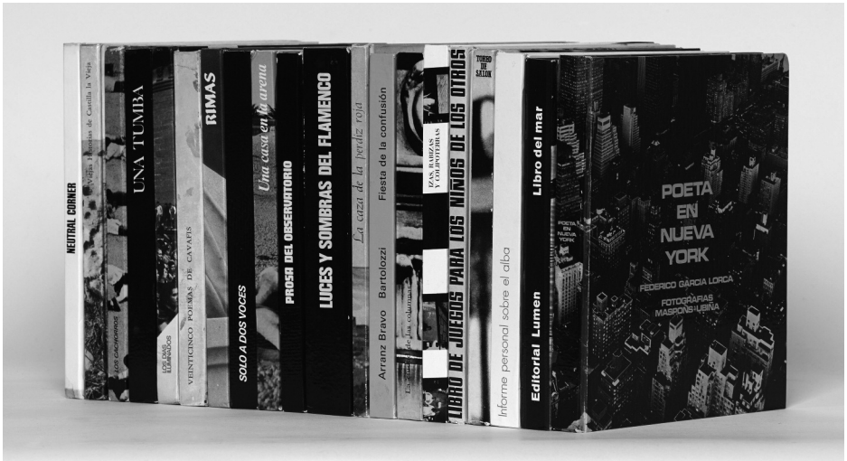
Books of the Collection Palabra e Imagen (Word and Image). Barcelona: Lumen, 1961–1975. Museo Nacional Centro de Arte Reina Sofía.