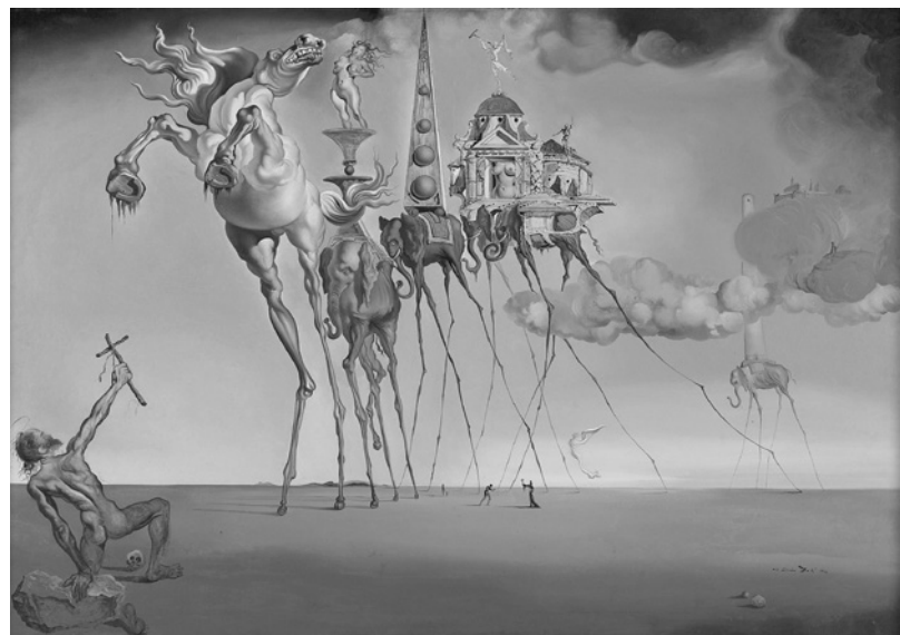
The Temptation of Saint Anthony, 1946. Oil on canvas, 89.5 x 119.5 cm. Musées royaux des Beaux-Arts de Belgique.

The subtitle of this exhibition comes from Salvador Dalí's San Sebastián (St. Sebastian), a 1927 article that is also an artistic manifesto. The phrase suggests a way in which the painter's work might be approached in a large-scale show such as this. Dalí is omnivorous, and we, the viewers, can follow suit thanks to the different possibilities offered by contemplation of his creations.