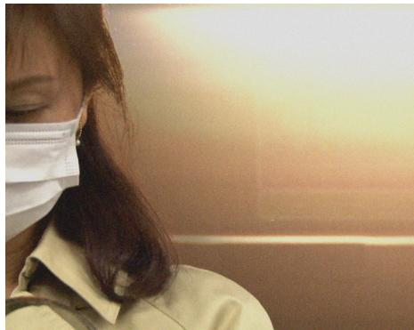
Angela Melitopoulos, The Life of Particles , 2012. Multichannel video installation

screen and highly standardized acoustical norms.